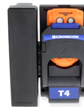
Vehicle charger Effective charging and storage whilst travelling