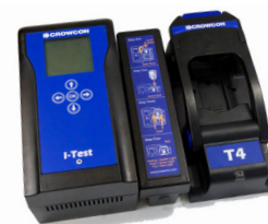
I-Test Easy automated bump testing and calibration solution