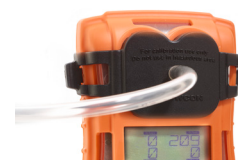
Bump/calibration plate To apply test gas to T4