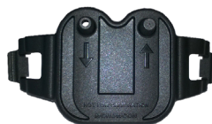
Aspirator plate Sample atmosphere prior to entry